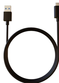
Figure 3.2. USB type-A to type-C cable.