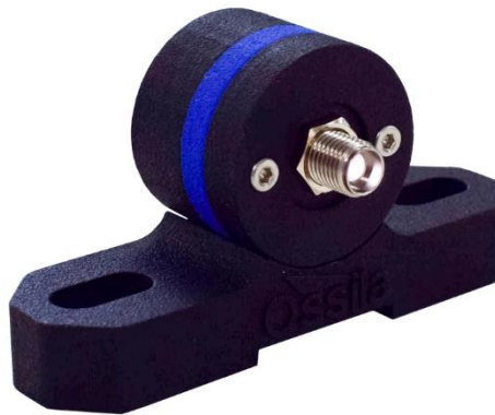
Figure 4.1. Ossila Broadband White Light.