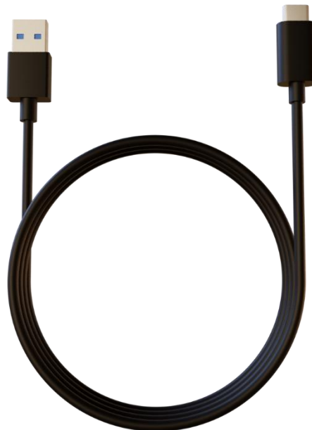
Figure 4.2. USB type-A to type-C cable.